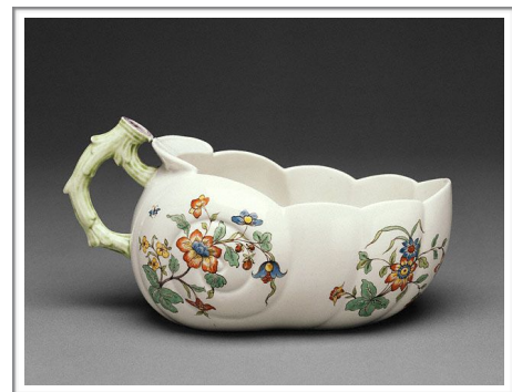
French chamber pot versus the Chinese chamber pot on the left